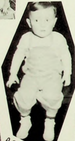
D.G.B. Watching senior play practice