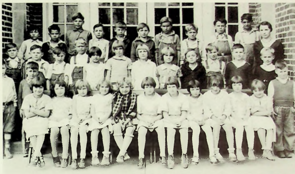
The Senior Class of 1942 in the third grade.